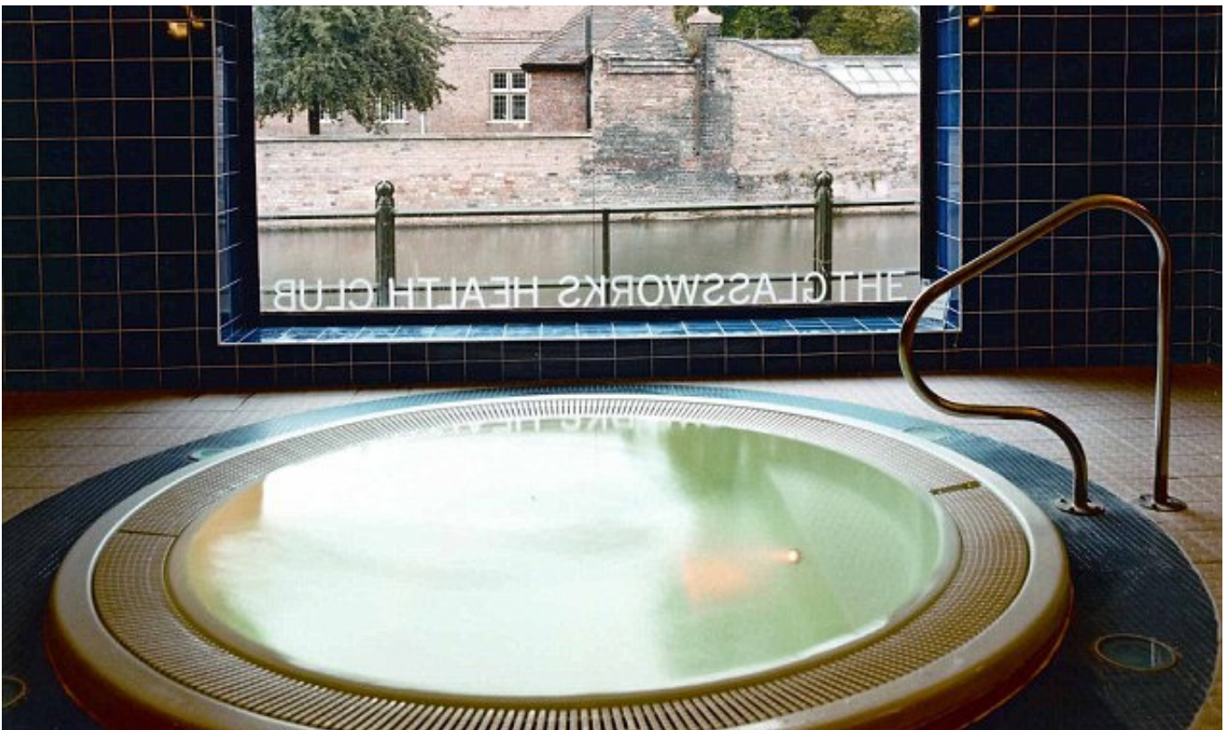
... and in the drink: Guests can relax in the spa's jacuzzi and watch the world go by on the River Cam

Once you've worked the weight off, you'll have fun putting it all back on at The River Bar Steakhouse & Grill, which is linked to Varsity.