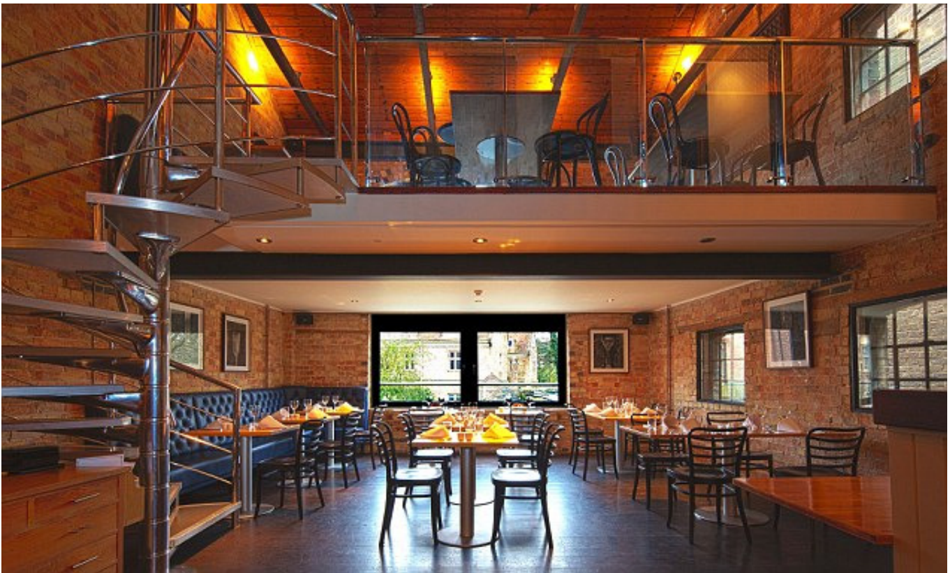
Food... The hotel is attached to the splendid River Bar Steakhouse & Grill