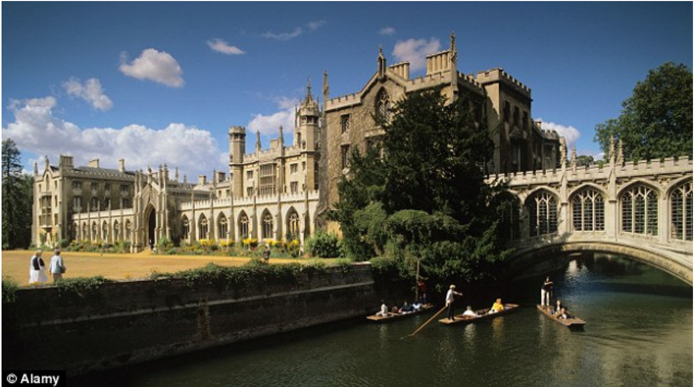
A view of people punting on the River Cam - a short walk from the Varsity Hotel

reasonably new addition to the ever-expanding Mr & Mrs Smith range.