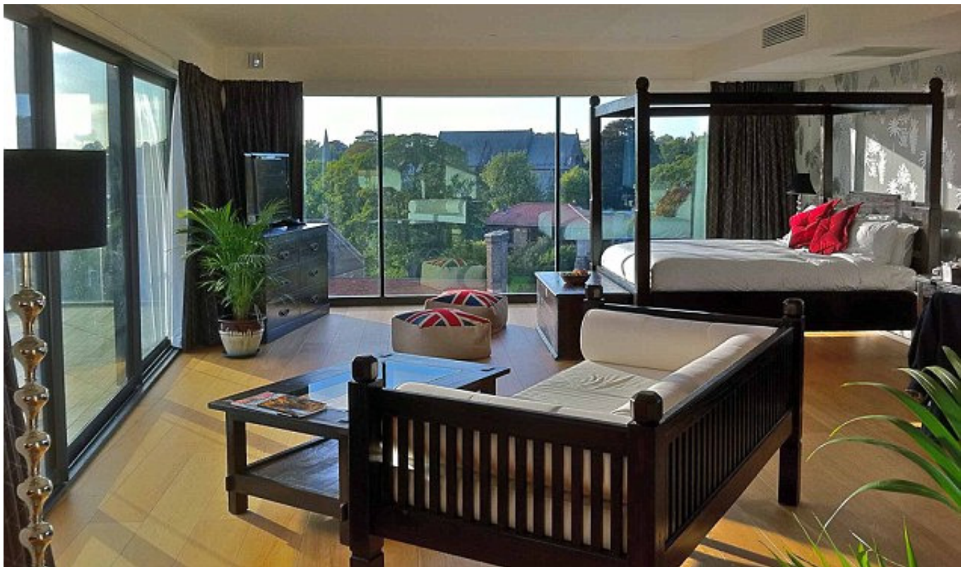
Room with a view: The floor to ceiling glass gives guests the perfect view over the city

But venture a mere 50 minutes north from London's King's Cross station and the opportunity to experience a world away from London's fast and furious pace presents itself in the shape of Cambridge.