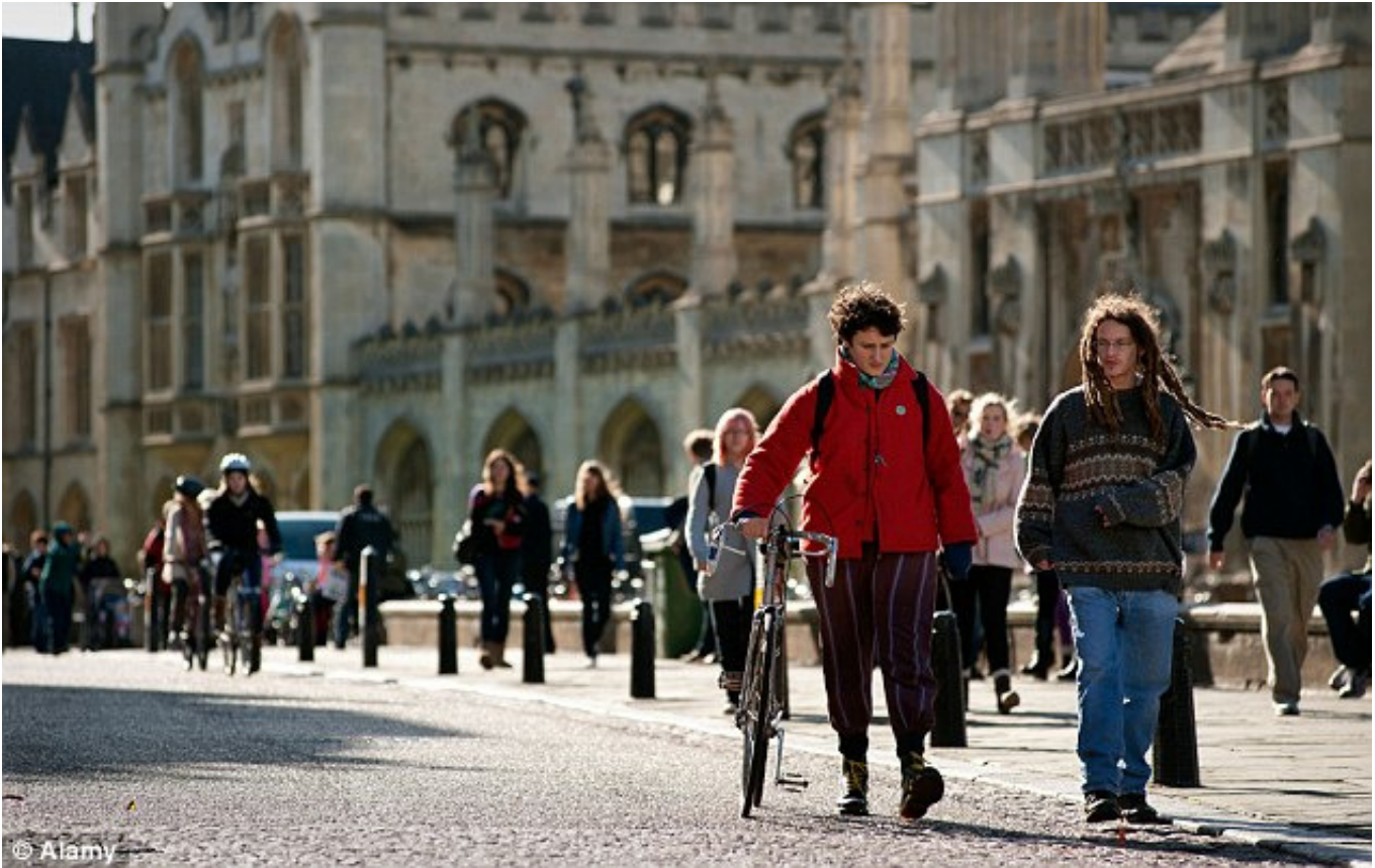
Heritage: Cambridge's history attracts millions of tourists each year, who share the city's streets with locals and students alike

All rooms are decked out with solid oak flooring, sandstone bathrooms with monsoon showers and some offer free-standing Victorian baths. The students would be jealous.